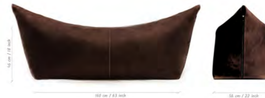
Maone design Viola Tonucci

Draft - Maone - fullgrain leather - plain