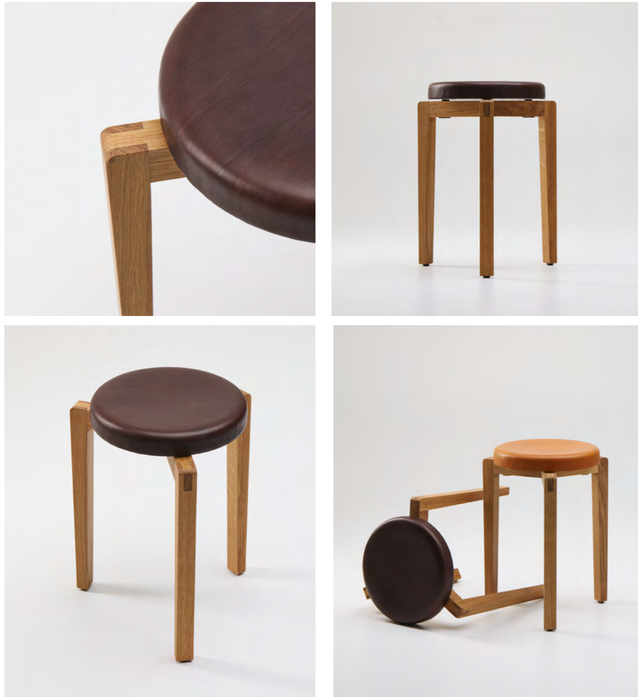
Enrico Tonucci designer The stool Gio is made of solid wood and has a genuine leather covered seat. Dimensions: seat diameter 30 x h 42 cm

SIGNATURE - Hall 7 stand A 93 (Ice Pavillion)