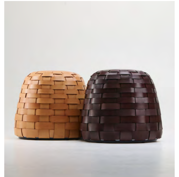
Viola Tonucci designer Trama is a soft pouf in genuine hand woven leather. Dimensions: seat diameter 38 x h 46 cm