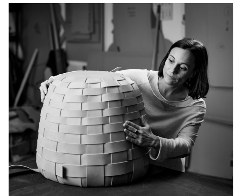
Viola Tonucci designer Trama is a soft pouf in genuine hand weaved leather. Dimensions: seat diameter 38 x h 46 cm