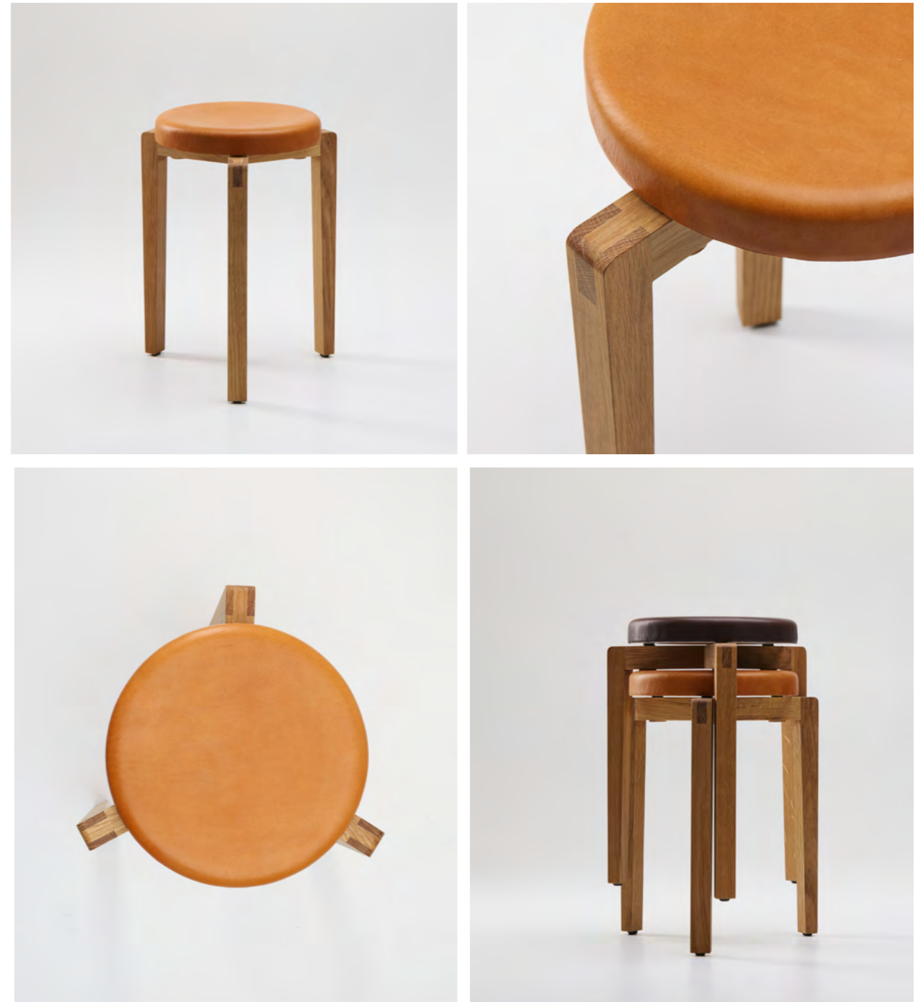
Enrico Tonucci designer The stool Gio is made of solid wood and has a genuine leather covered seat. Dimensions: seat diameter 30 x h 42 cm

SIGNATURE - Hall 7 stand A 93 (Ice Pavillion)