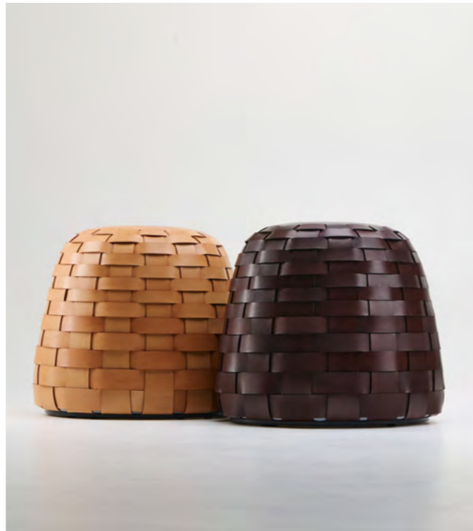
Viola Tonucci designer Trama is a soft pouf in genuine hand woven leather. Dimensions: seat diameter 38 x h 46 cm